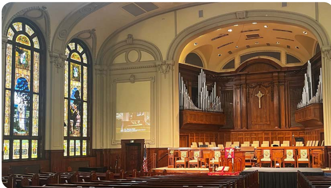
First Methodist Church, Shreveport, Louisiana