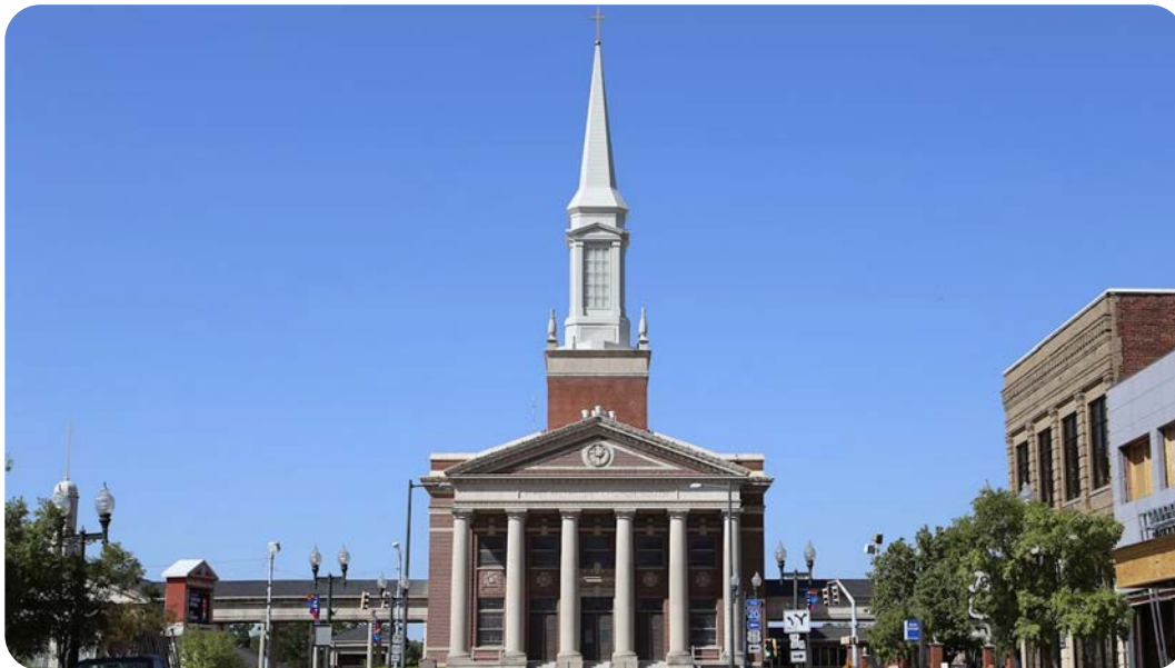
First Methodist Church, Shreveport, Louisiana